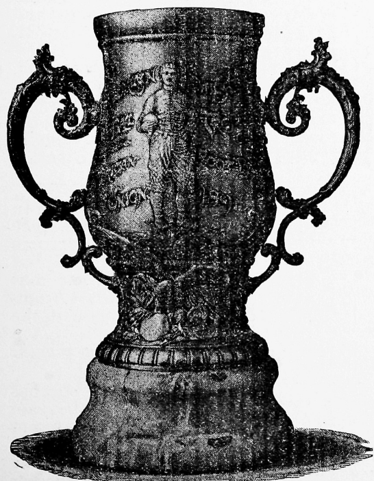
THE "BROOKLYN DAILY EAGLE" FOOT BALL TROPHY.